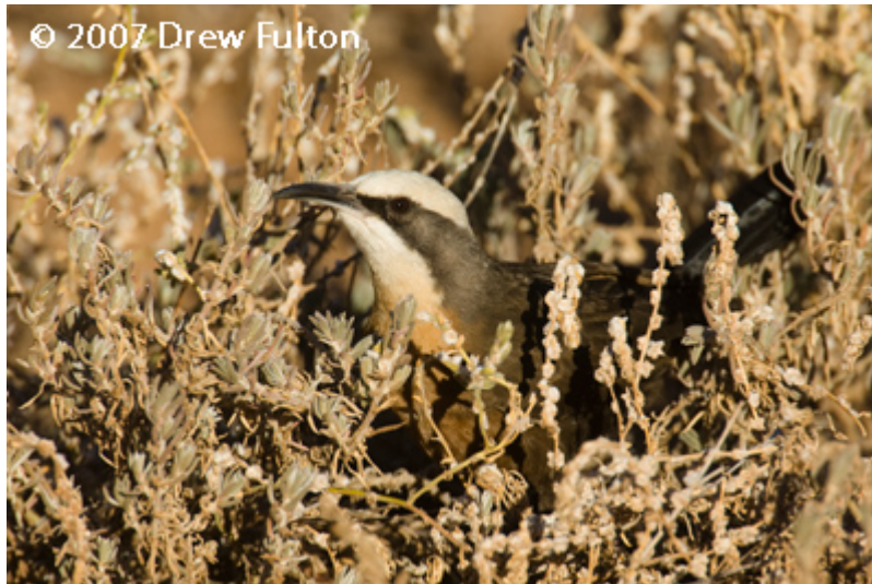
Gray-crowned Babbler – Olive Pink Botanical Gardens, Alice Springs, Northern Territory

I saw a ton of Gray-crowned Babbler over the past year but it wasn't until the beginning of this month that I could finally get some photos of one. At first, I didn't like this image because it had some much vegetation and was a busy image but it is quickly growing on me.