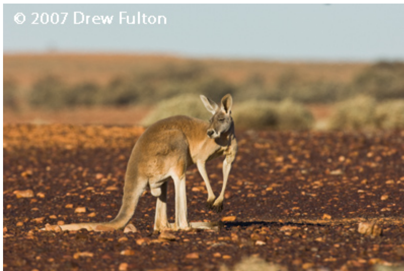
Red Kangaroo – Northern Territory

This is the view of Kata Tjuta from the traditional sunset carpark. The rock really shows up orange at sunset. The spot can also get quite crowded but nothing like sunrise at Uluru. The sheer numbers of people are almost as impressive as the actual sunrise.