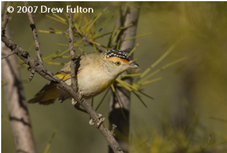
Red-browed Pardalote – Olive Pink Botanical Gardens, Alice Springs, Northern Territory

There are four species of pardalotes in the world and they are all found in Australia. I had photographed all but the Red-browed Pardalote, a bird of the outback regions. Finally, I was able to get close to a pair of these little jewels for only a few seconds but I did manage to get this frame, completing the set.