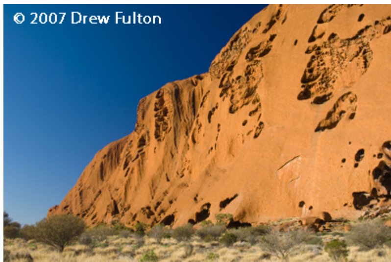
Uluru – Uluru-Kata Tjuta National Park

This scene was taken along the side of the road in King's Canyon National Park. King's Canyon itself cuts into this ridge farther to the south. The mountain ranges in Central Australia are mind boggling as they seem to erupt out of the surrounding plain with no foothills or any other transitions.