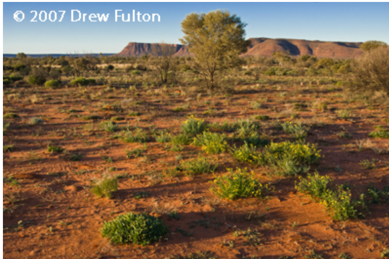
King's Canyon National Park, Northern Territory

This scene was taken along the side of the road in King's Canyon National Park. King's Canyon itself cuts into this ridge farther to the south. The mountain ranges in Central Australia are mind boggling as they seem to erupt out of the surrounding plain with no foothills or any other transitions.