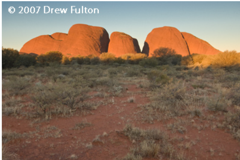
Kata Tjuta (The Olgas) – Uluru-Kata Tjuta National Park, Northern Territory

This is the view of Kata Tjuta from the traditional sunset carpark. The rock really shows up orange at sunset. The spot can also get quite crowded but nothing like sunrise at Uluru. The sheer numbers of people are almost as impressive as the actual sunrise.