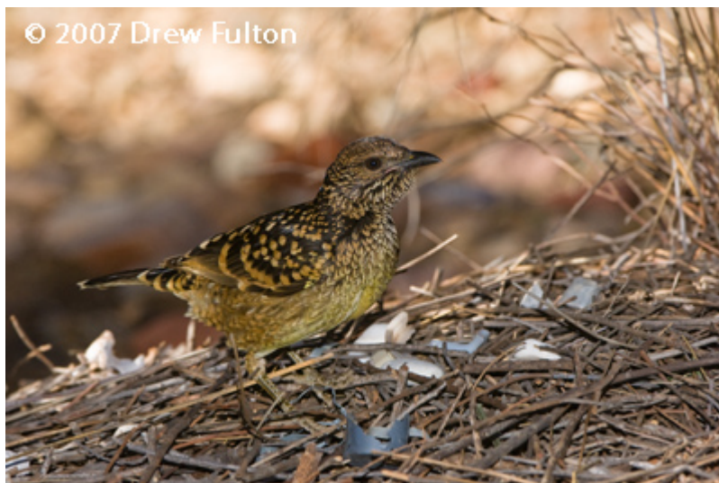
Western Bowerbird – Olive Pink Botanical Garden, Alice Springs, Northern Territory

I saw a ton of Gray-crowned Babbler over the past year but it wasn't until the beginning of this month that I could finally get some photos of one. At first, I didn't like this image because it had some much vegetation and was a busy image but it is quickly growing on me.