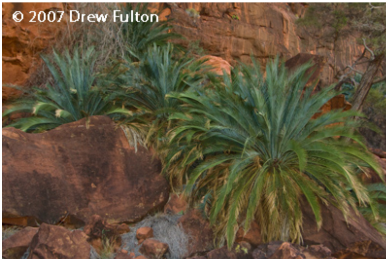
Cycads – Palm Valley, Finke River National Park, Northern Territory

There are four species of pardalotes in the world and they are all found in Australia. I had photographed all but the Red-browed Pardalote, a bird of the outback regions. Finally, I was able to get close to a pair of these little jewels for only a few seconds but I did manage to get this frame, completing the set.